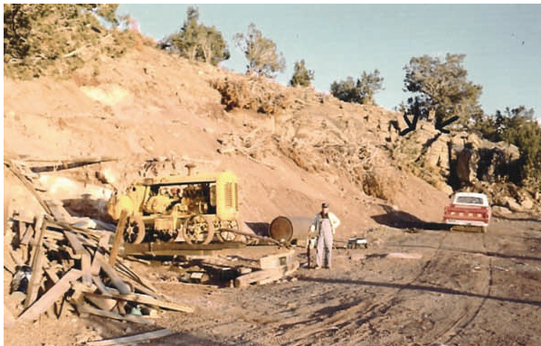
Jose's excavation site, with the old air compressor sitting in front of the shaft

While eating, Kent's parents showed up. Two hours after the blast, they all headed back up the mountain to the shaft. Kent went down first to see if they had broken into the chamber. When they didn't hear from him Duane went down. He started yelling to pull