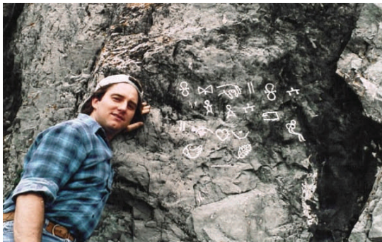
Author at a mystery glyph symbol site in Provo, Utah

It was now three deaths three widows and a whole bunch of fatherless children and still no gold plates. The town’s people started whispering that maybe this site and the symbols were haunted. And so it was rumored that people who go looking for church treasure connected with these symbols end up dead. There are more of these symbol sites