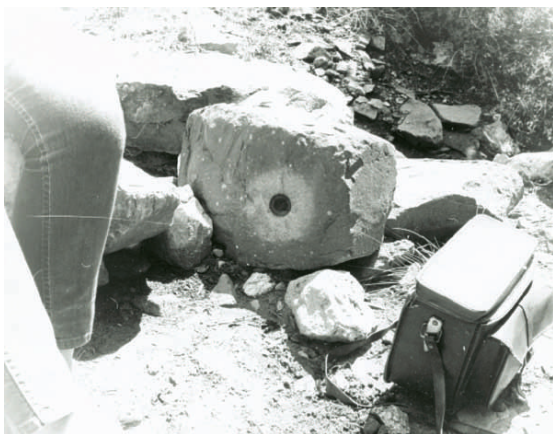
Rock with the drill hole they found while determining where to sink their shaft.

The rest of that winter found Jose working on the translation of the symbols and surveying the area. When the snow finally melted, they started marking the area for the place to dig. Jose figured the inscriptions said to draw a square area 100 cubits per side. And